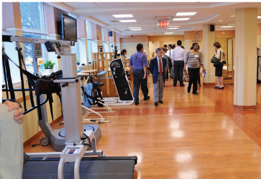
Visitors tour our expansive state-of-the-art Rehab Gym at the Grand Reopening Celebration

“Like many of our colleagues in government, my grandfather too, was here for a period of time and the sensitivity and compassion shown by the leadership and staff at Margaret Tietz was just overwhelming and very touching,” she said. “And it speaks volumes that so many of us have had family and loved ones here. What a wonderful asset this facility is for the entire Queens community.”